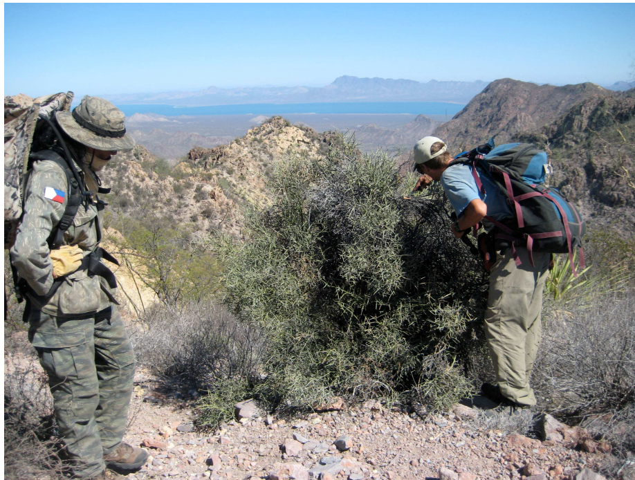
Canotia holocantha on Isla Tiburón Figure 2. This plant (Wilder 07-549) is 1.3 m tall and was the largest individual of Canotia holocantha seen on the island.