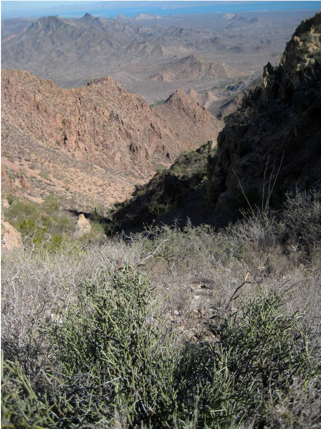
Canotia holacantha on Isla Tiburón Figure 1. Canotia holacantha on the exposed upper ridges of Isla Tiburón (image by Benjamin Wilder 26 October 2007).